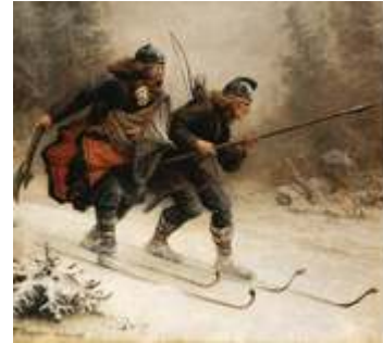
The two Birkerbeiners brought the young Haakon Haakonsson to safety in 1206 across the stormy and dangerous mountains from Lillehammer to Østerdalen.

(Based on information from www.birkebeiner.no , the race's official website)