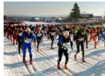
Thousands of skiers participate in the historical race every year. This picture was taken at last year's race.

More Birkebeinerrennet homepage Links Norwegian Ministry of Foreign Affairs