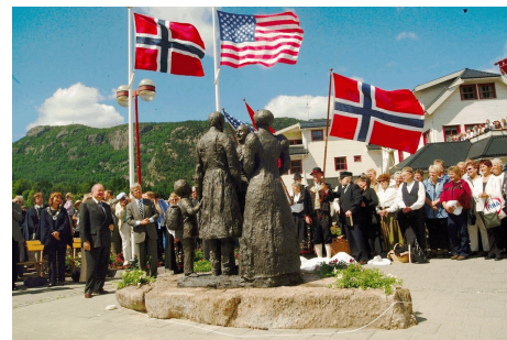
Sørlandet Utvandrercenter Monument

Kvinesdal is the site of the Sørlandet Emigrant Center Monument, sculpted by Tore Bjørn Skjølvik. The monument was unveiled during Utvandrerfestivalen (The Emigrant Festival) in 2002 in co-operation with Sørlandet i 100 , a festival celebrating the 100-year anniversary of the name “Sørlandet.” “The monument will enhance the