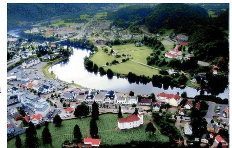
Aerial View of Kvinesdal

See the website listed below for more information on Viking Lodge and the Emigrant Museum, Festival, and Monument.